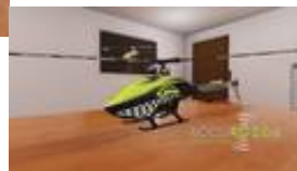
AccuRC 2.0.2 Build